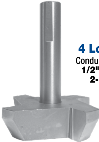
4 Lobes Conduit Sizes 1/2" thru 2-1/2"