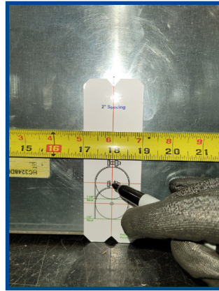
Step 2: Mark