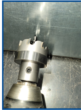
Step 3: Drill