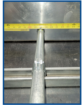
Step 4: Install