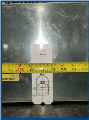
Step 1: Measure